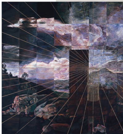
Kangaroo Blank 1988 Oil stick, gouache and oil paint on 78 canvas boards

In Kangaroo Blank (above), the fact that Tillers has worked on separate canvas boards is very obvious, due to the fact that parts of the landscape and sky are slightly off-set. He has developed a dramatic tonal contrast in this piece and has included loose brushwork in his rendering of the clouds and rocks. Tillers has also used strong diagonals to unify the surface, but also suggests religious imagery.