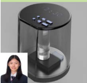
ALARM CLOCK FOR HEARING IMPAIRED