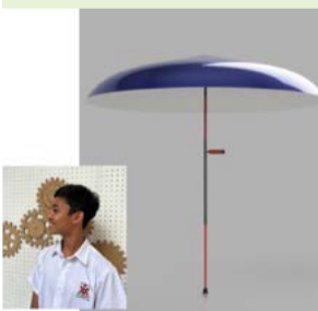
ADJUSTABLE WALKING STICK AND UMBRELLA